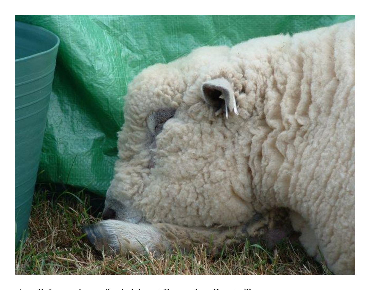
A well deserved nap after judging at Carmarthen County Show.

Once judging is over remember to make the sheep comfortable and provide some well earned food before you go off for a look around the show.